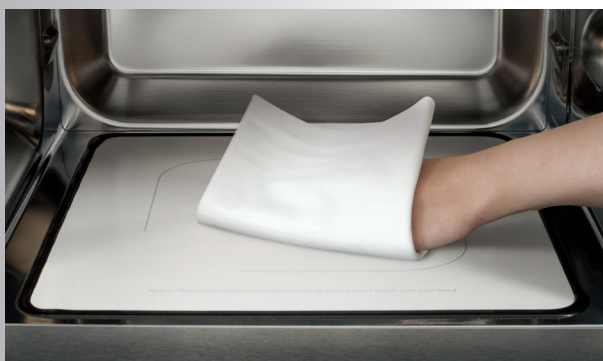
Easy cleaning of the CERAMIC floor

Due to the ceramic reflector floor, the size of the usable microwave dishes is no longer limited to the diameter of the turntable. The usable area is thus up to 60% larger than comparable devices with turntables - with the same, compact external dimensions. Therefore a 20 liter CERAMIC microwave oven has the same useful capacity as a classic 30 liter appliance.