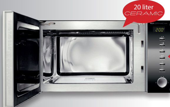
20 liter microwave with CERAMIC floor

The innovative ceramic floor ensures an even distribution of the microwaves, so that the food is cooked perfectly from all sides.