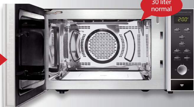
30 liter microwave with turntable

Due to the ceramic reflector floor, the size of the usable microwave dishes is no longer limited to the diameter of the turntable. The usable area is thus up to 60% larger than comparable devices with turntables - with the same, compact external dimensions. Therefore a 20 liter CERAMIC microwave oven has the same useful capacity as a classic 30 liter appliance.