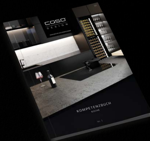
Competence book kitchen